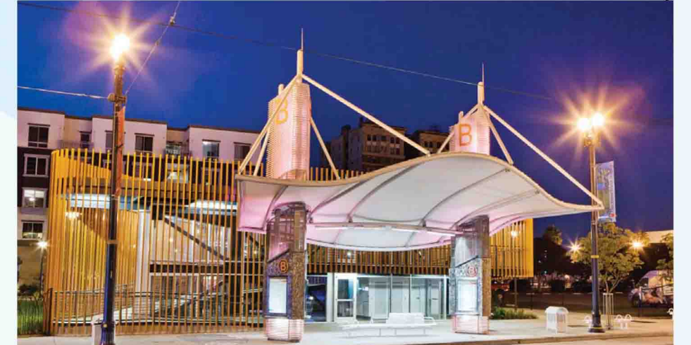
Long Beach Transit Mall, "Best Project of 2011 for Renovation"