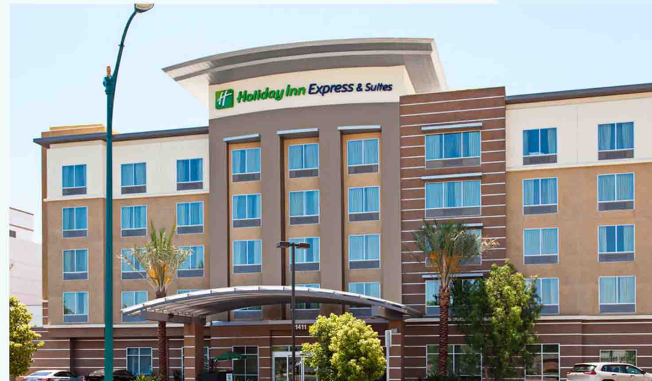
Holiday Inn, Anaheim