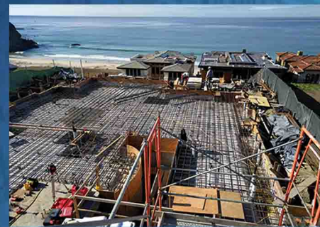
MULTI-FAMILY / MIX-USE