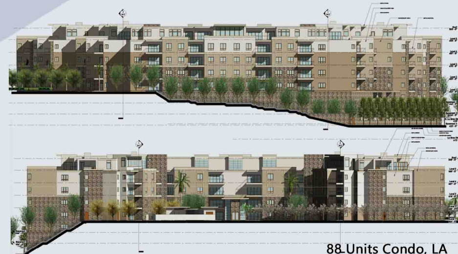
88 Units Condo, LA