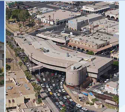
Calexico West Port of Entry