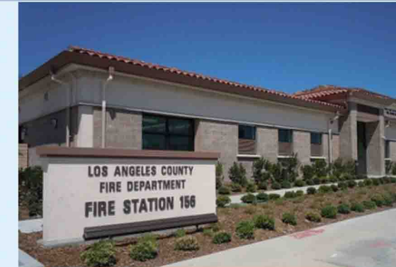
Fire Station, LA