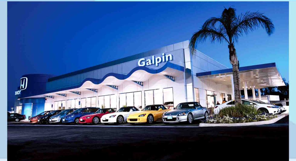
Galpin Honda, San Fernando