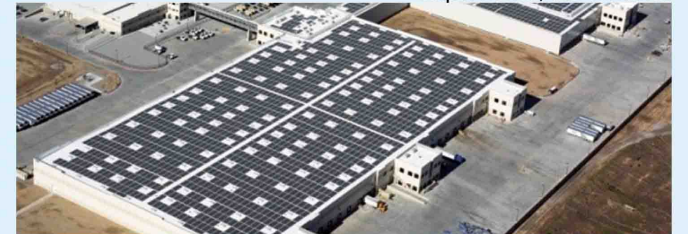
400,000 S.F. Tesco Food Distribution, Riverside