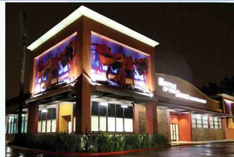
Battle of the Dance theater